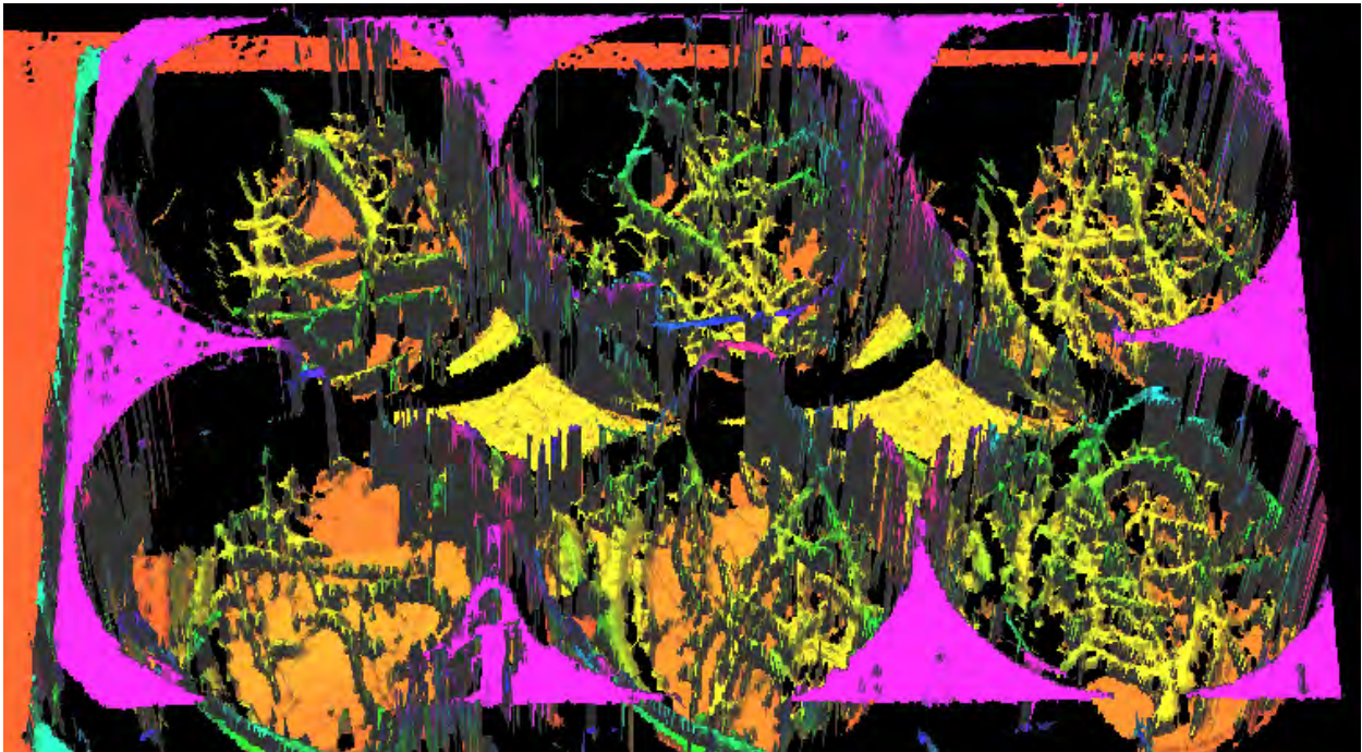
Roots in a 6 well plate