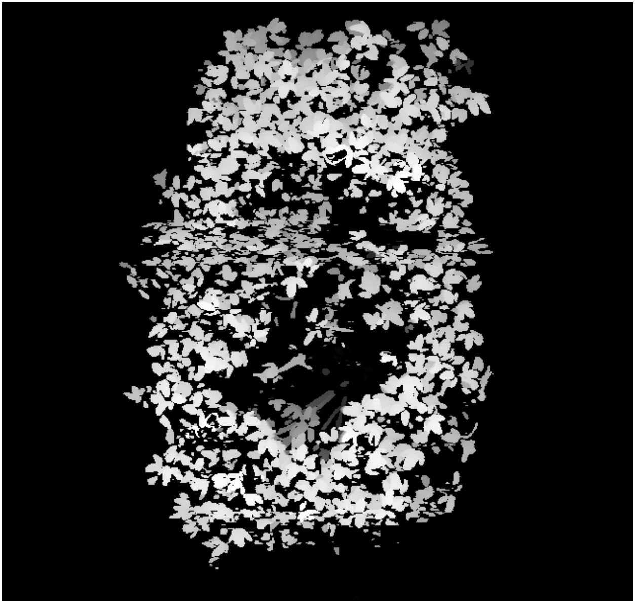
Cress plants in height