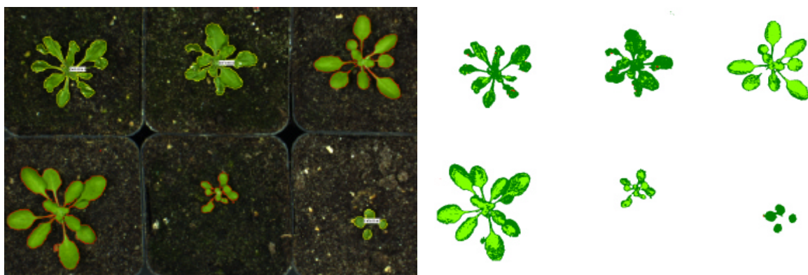
Analysis based on leaf size, leaf number and colour

LemnaTec Bonit GH software enables you to efficiently quantify a large set of growth parameters and thus to establish a basis for rational screening and further data mining projects.