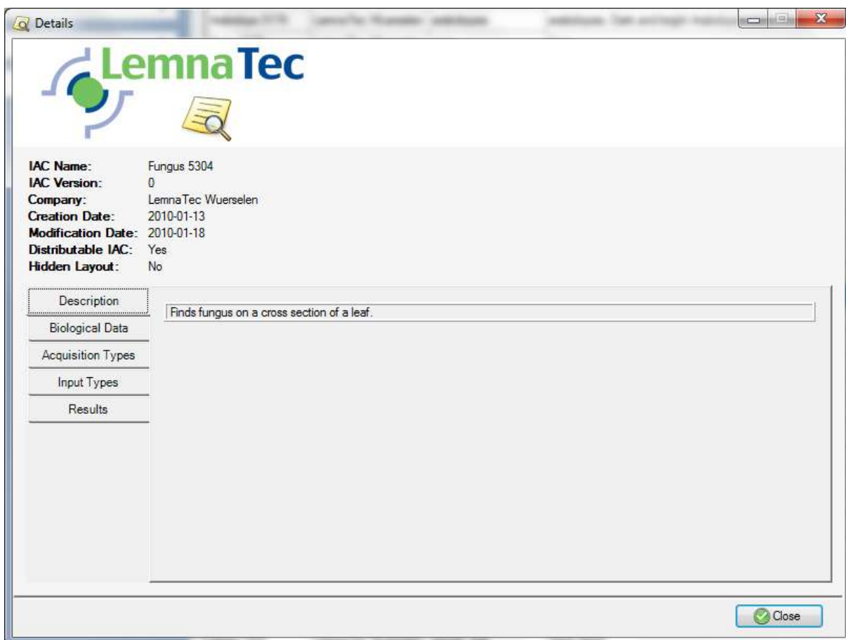
Figure 2 Details window

As well as the textual data, there are example pictures for all new IACs. These are downsized resulting images from the analyses. The example images are automatically displayed in the image browser as soon as an IAC is selected. There are normally several example images per IAC. Both arrow buttons under the image are used to navigate through a list of images. The shown example images can be displayed in a separate window on request. To do this, simply click on the example image.